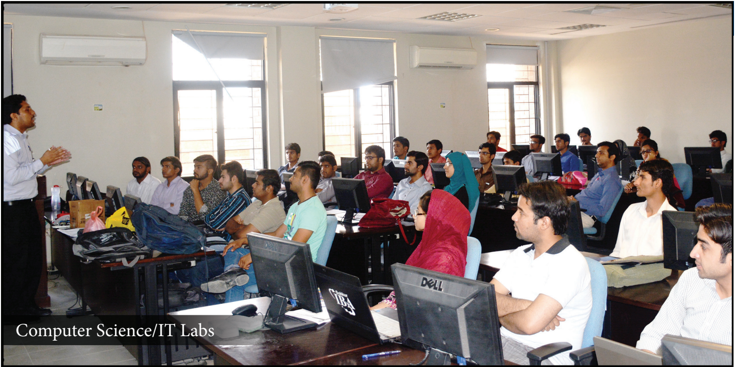
Computer Science/IT Labs