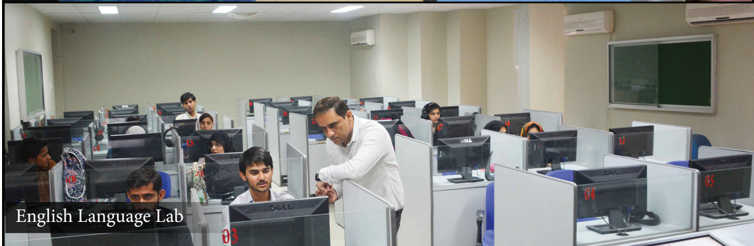
English Language Lab