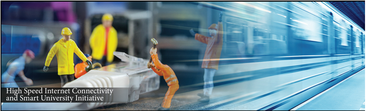
High Speed Internet Connectivity and Smart University Initiative