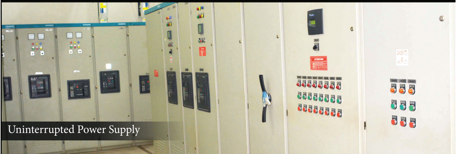
Uninterrupted Power Supply