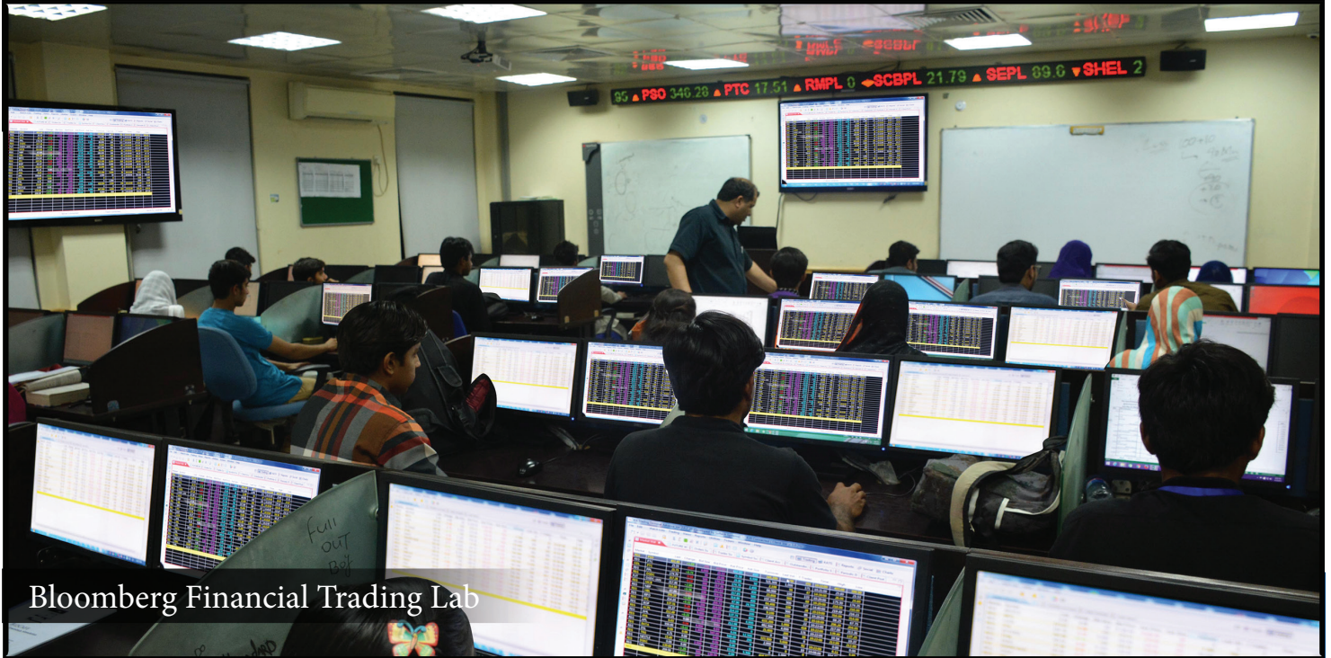
Bloomberg Financial Trading Lab